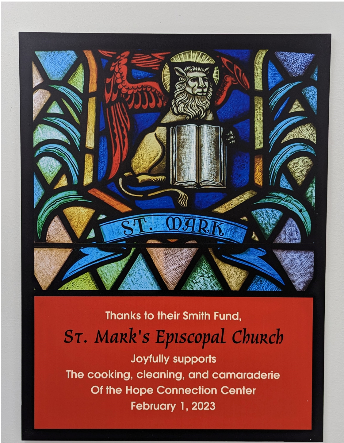
Plaque next to the kitchen at the Hope Connection Center on Arch St.