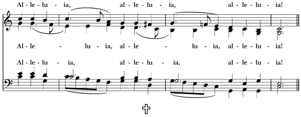
THE WORD OF GOD