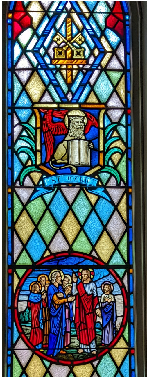
Erwin Chapel St. Mark's Window

www.stmarksnewbritain.org www.facebook.com/saintmarksnb